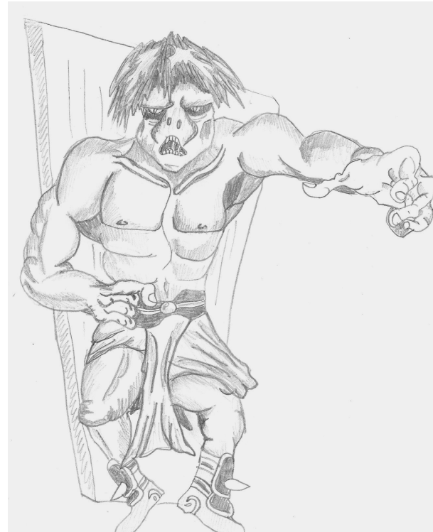
Frankenstein's Monster, lumbering toward his next victim.

Until the Doctor finds a way to live for all time through his research, he sends his monster across the lands, listlessly searching for bodies to be used in his vile experiments.